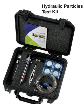
Hydraulic Particles Test Kit

Monitoring your hydraulic and gearbox oils is a necessary part of any preventative maintenance programme.