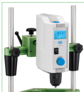
6A. Overhead Stirrer, Digital 115v

Approx. Stand Dimensions: 15.25 W x 17.25 D x 40”H